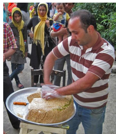
The man who made a Persian form of 'nougat' was popular.