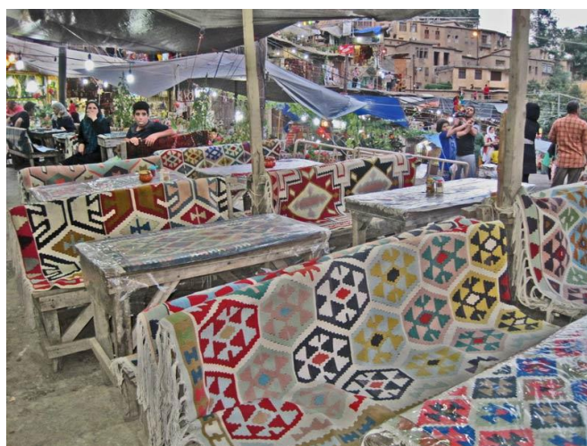
By now the many teashops in Masouleh, with their colourful flags and rugs were beckoning...