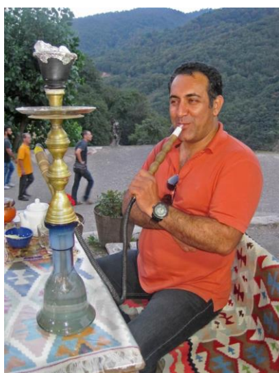
Smoking a 'hubble-bubble' is a favourite pastime. This patient man was photographed many times!