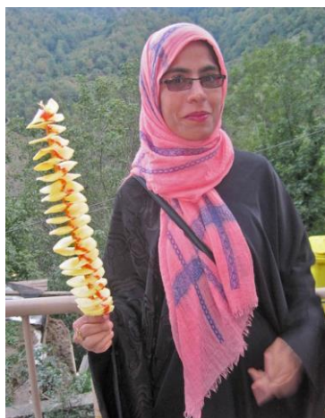
Potato crisps come in one long spiral on a stick. Photo EW