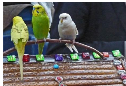
These budgerigars were happy to climb onto visitors' hands.