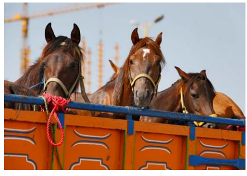
Horses waiting to be unloaded before a horse show held on the shores of the Caspian Sea at Rasht, in August 2014.