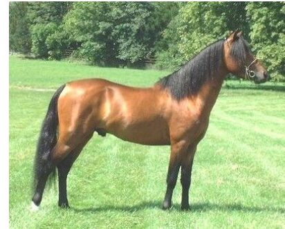
A pure bred Caspian stallion standing 11.2 hands high

All members of the family were able to use the Caspian.